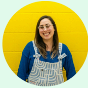
Operations & Product Manager Serious Tissues

"Up Club has been a game-changer. The insights, community, and real-world advice have helped me solve challenges faster, improve marketing results, and drive impact without increasing spend."